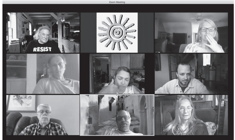
CAN’s Weekly Organizing Meetings are now on Zoom

We will continue to monitor decommissioning activities at