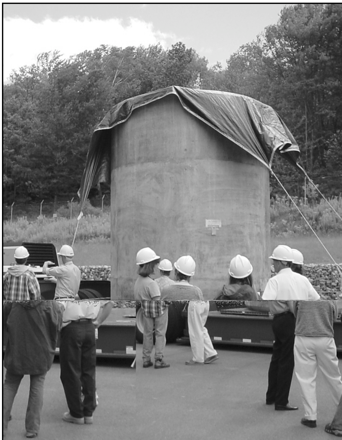
CAN members and Yankee Rowe officials check out a waste storage cask.

The ASLB judges agreed with CAN; Yankee has appealed to the NRC Commission to overturn the judges decision. The judges said that without more detail, Yankee's submission is premature. The ASLB validated decommissioning community concerns about how little information nuclear corporations provide to defeat democratic participation and by undermining public participation, how dirty clean up can get. We were represented ably by Attorney Jonathan Block.