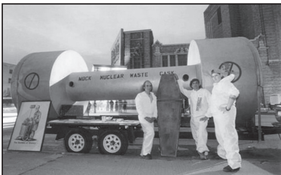
CAN's mock high-level waste cask before its maiden voyage (above) and now in need of repair (at right).

CAN is looking for volunteers to rehab our mock high-level waste cask. No experience with radiation necessary! Email: Veronique@nukebusters.org