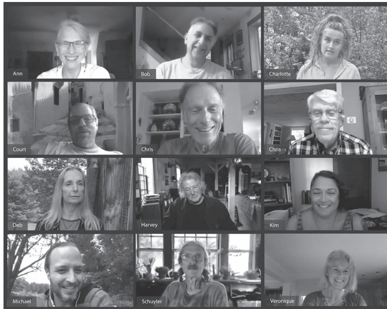
The CAN Video Team

Most impressively, I've found everyone to be adaptable. My