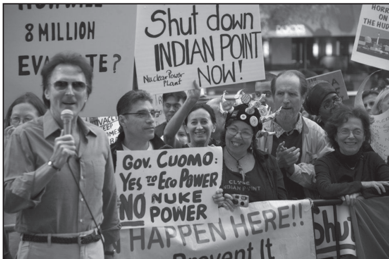
Gary Null at Indian Point Rally

Gary Null, NYC's noted health guru and documentary filmmaker, has joined the fight against the Indian Point Nuclear Reactor! On Oct. 8, Null issued a call to arms to more than 400 people attending a Close Indian Point rally in front of Governor Cuomo's Manhattan office. He had high words of praise for the Governor's long standing commitment to shut the twin reactors, and urged residents to back the Governor's refusal to grant water quality permits to the Indian Point Plants. Though he praised the governor, Null urged residents to pressure the Legislature to oppose the relicensing of Indian Point.