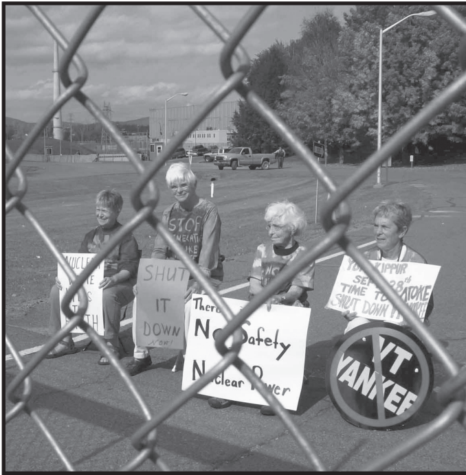
Four Grannies in Birkenstocks behind the fence at Vermont Yankee Sept. 28, 2009.