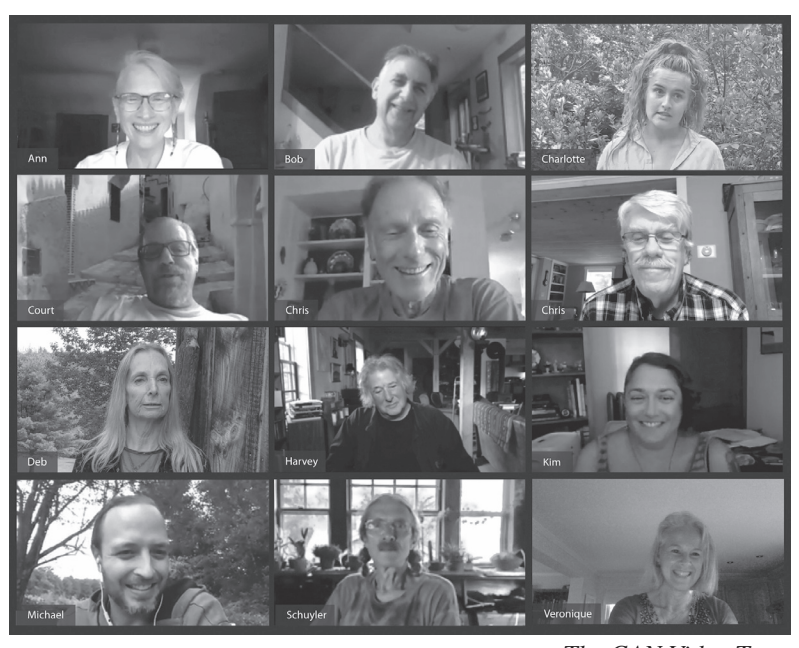
The CAN Video Team

set of very different skills were immediately embraced as valuable because of their differences. Where performers often have ego, we just do things if they make sense and might be effective, wherever the idea came from. Not only is there no red tape, a good idea may find itself being executed seemingly as it's being spoken.