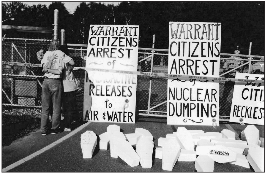
At the Gate to Vermont Yankee, 1999

We would love to share with you, our supporters, more of