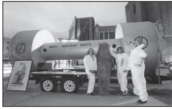
CAN's mock high-level waste cask before its maiden voyage (above) and now in need of repair (at right.

CAN is looking for volunteers to rehab our mock high-level waste cask. No experience with radiation necessary! Email: Veronique@nukebusters.org