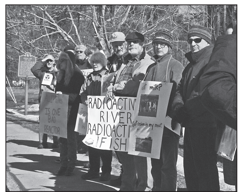
Fukushima Vigil.

CAN, with AGREE, VCAN and Pilgrim Watch submitted a 2.206 petition to the NRC to shutter these nukes because of Entergy's financial instability. This instability jeopardizes Vermont Yankee's safe operation. How? Entergy needs to cut as many corners as it can to limit its losses and remain open. Cutting corners jeopardize our safety! It leads to delayed maintenance and delay in the replacement of its condenser. It leads to taking risks by not following procedure. It leads to systemic mismanagement! One day after we submitted our petition, NRC asked Entergy to explain its financial situation for Vermont Yankee. Vermont Yankee (according to UBS) is estimated to lose on average $27 million a year- growing to $40 million in 2016. When the state wins its