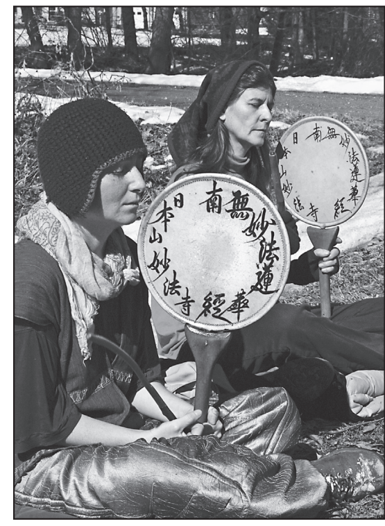
Fukushima Vigil - drummers, Photo by Cate Woolner