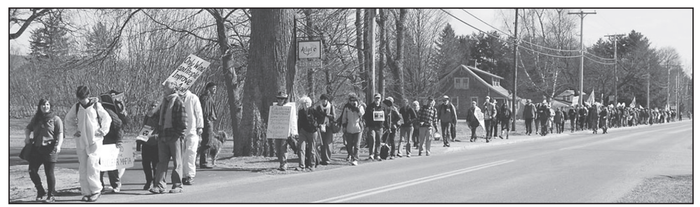
Fukushima Anniversary walk from Vermont Yankee in Vernon to Brattleboro.