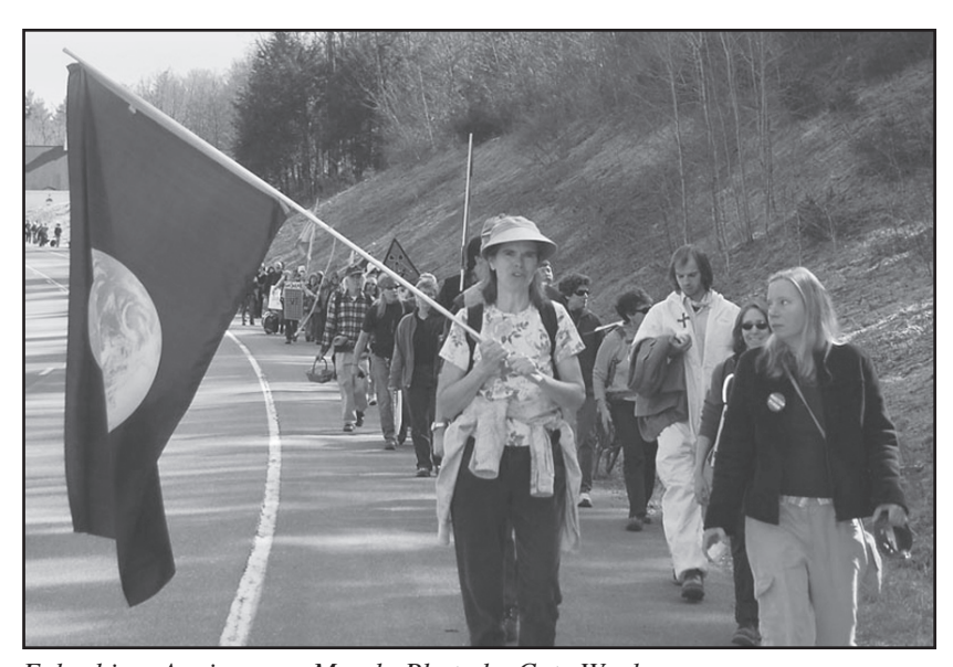
Fukushima Anniversary March.

We were finally cited with "unlawful trespass," cuffed with plastic bands, and boarded the bus. Another wait for more pas-