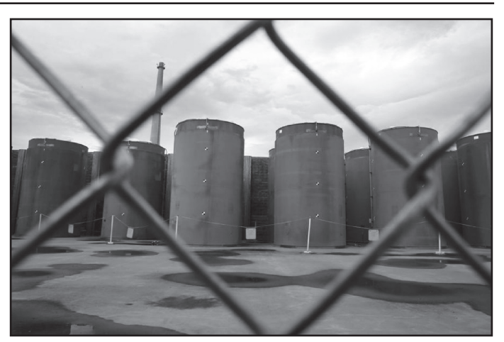
Dry Casks - Vermont Yankee