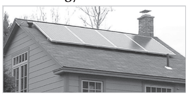
Win a Solar Panel system worth $2,000 Let the sun shine in to support the Citizens Awareness Network's efforts to replace VY with safe, green, renewable energy.