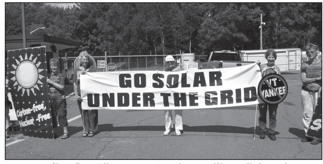
Shut it Down Affinity group action at the gates of Vermont Yankee nuclear reactor

A manifesto recently crafted by the Shut It Down affinity group proclaims their motivations and objectives. In continuing efforts to shut down the Vermont Yankee nuclear power plant in Vernon, the 22 women have embraced civil resistance on 12 occasions since 2005. Groups ranging from five to fifteen women have breached gate security at the plant during