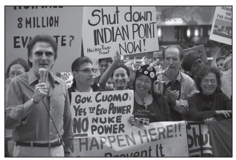
Gary Null at Indian Point Rally

Gary Null, NYC's noted health guru and documentary filmmaker, has joined the fight against the Indian Point Nuclear Reactor! On Oct. 8, Null issued a call to arms to more than 400 people attending a Close Indian Point rally in front of Governor Cuomo's Manhattan office. He had high words of praise for the Governor's long standing commitment to shut the twin reactors, and urged residents to back the Governor's refusal to grant water quality permits to the Indian Point Plants. Though he praised the governor, Null urged residents to pressure the Legislature to oppose the relicensing of Indian Point.